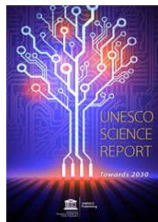
UNESCO Science Report: towards 2030 English (pdf)